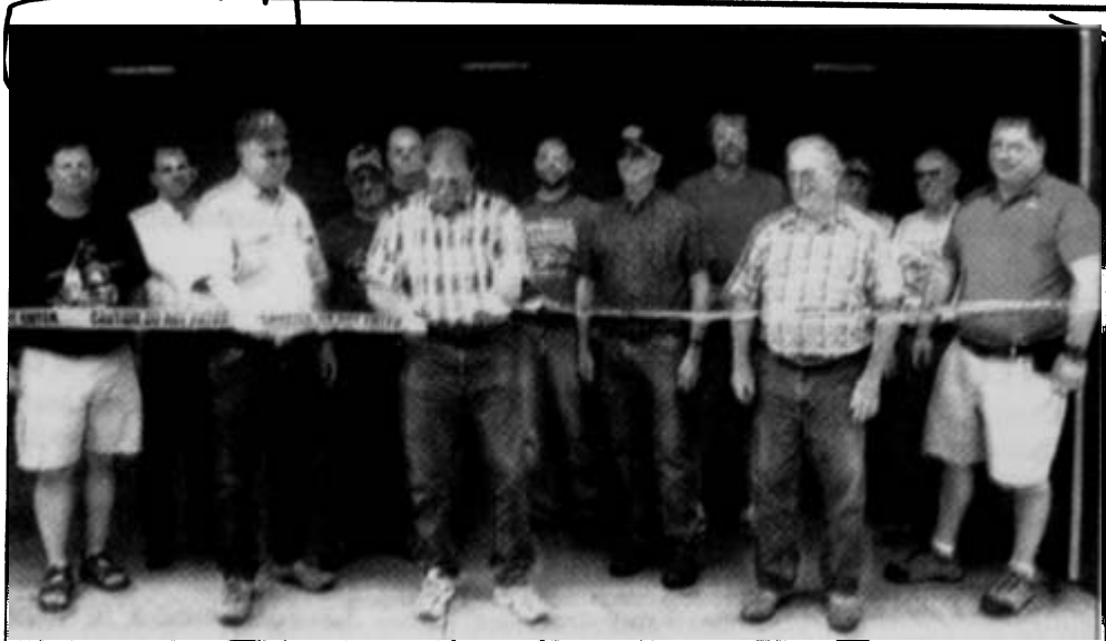
Members of Rush County Fire District No. 4 cut the ribbon on June 13 at the open house for the new fire station in La Crosse. A hamburger meal was served for approximately 120 people during the event.